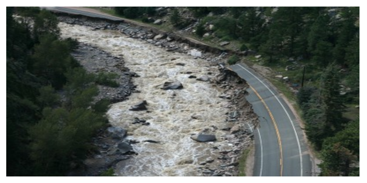
Permanent reconstruction work in the Big Thompson Canyon is going forward now in a stepped-up schedule. This is how this section of US 34 looked after the September 2013 floods.

CDOT to Shave Nearly Two Years from US 34 Reconstruction Time